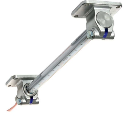
LTC ..Y (24Vdc)