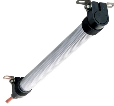
LTC ..HV (230Vac)