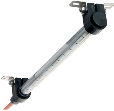
LTC .. (24Vdc)