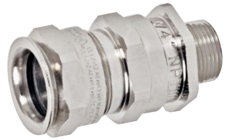
ADE 4F NPT